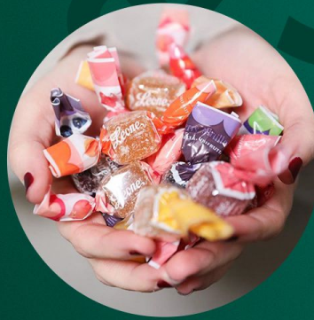
Traditional culture candies from Pastiglie Leone